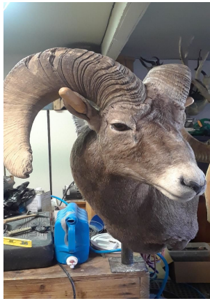
Big Horn mount by Dan Grayson